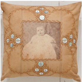
Great Grandma's Pillow , page 39 of Crazy-Quilted Memories .

Students will learn how to age fabric using the B.A.M. system. This 14" x 14" one block piece can be made into a pillow, small quilt or a wall hanging. This class